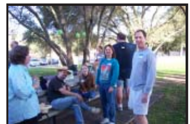
SIS members take a break after completing another project