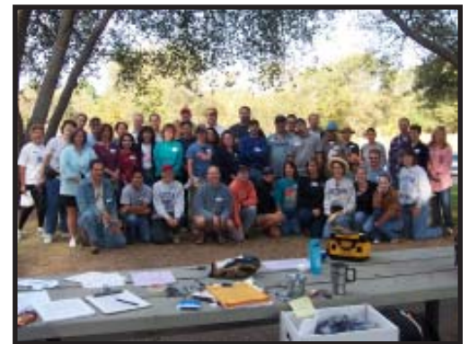
Off to a great start! Singles In Service members at one of their first projects--The American River Parkway Clean-up in September 2003